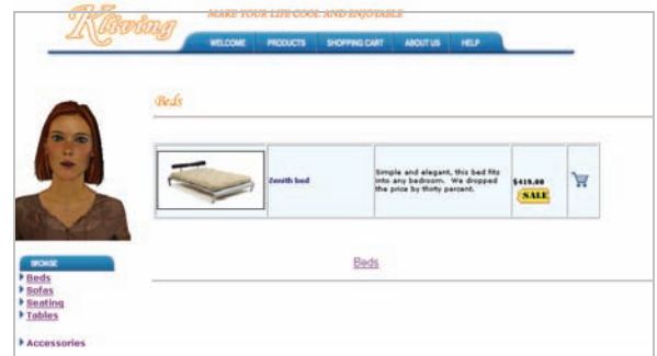
Figure 5: Furniture shopping website.

The female character was created using Haptik Inc.'s People Putty [HAP05]. The social agent speaks about the items in a similar manner to an actual shopping assistant. Although much of the product information is available as text, she offers supplementary information and occasionally makes suggestions.