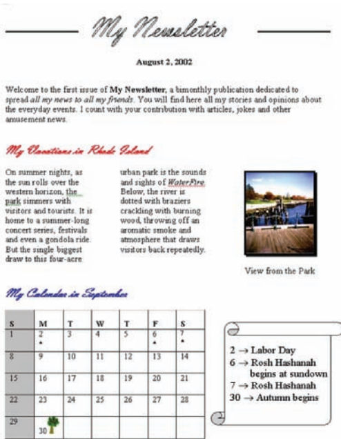
Figure 1: Word processing task.

each eyebrow downward. The frontalis brings the eyebrows upward. The zygomatic muscles control movements of the mouth and produce expressions like smiles.