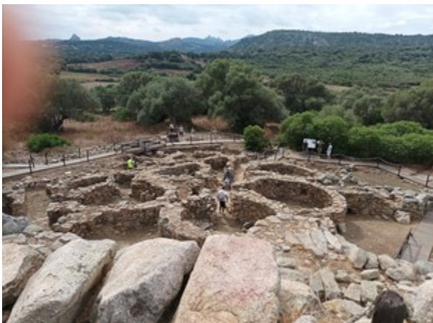
Figure 2: The “La Prisgiona” Nuraghe, in Northern Sardinia and the surrounding countryside from the top of the monument.

For research purposes, only the positive cases have been taken into account, whereas the uncertain ones will be analyzed in a second phase. Once the image dataset will be substantial, we will proceed with the AI training.