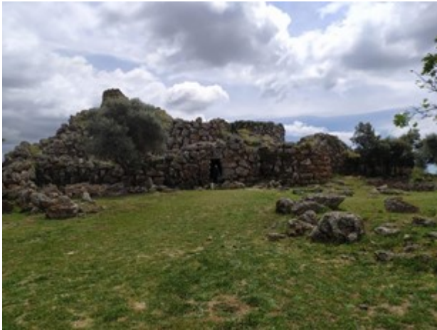
Figure 1: The “Arrubiu” Nuraghe, in Central Sardinia

nuraghes found in environmental contexts, but easily recognized); uncertain cases (e.g., nuraghes found in environmental contexts, but hardly recognized); negative cases (e.g., nuraghes that were obliterated by subsequent structures).