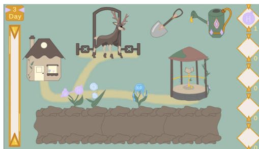
Figure 3: The Game User Interface.

Each week gives the players a certain amount of preparation time to build up their defenses. The initial phase involves the aspects of farming and crafting. During this phase, the player prepares for impending attacks by cultivating and strategically placing plants and taking care of "Aurora". In the second phase at night, the player is able to steer "Aurora" to support the preplaced plants in protecting