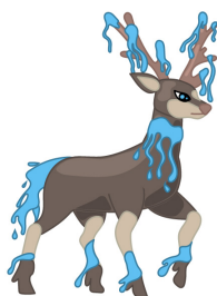
Figure 2: Aurora can transform into a magical water deer.

As an identification figure for the player, we introduced a deer named "Aurora" as an additional feature into the game concept. By feeding the deer with compound plants, it undergoes a transformation into a unique life form. This emphasizes the significance of compound plants in contrast to the elemental plants and serves as additional motivation for players.